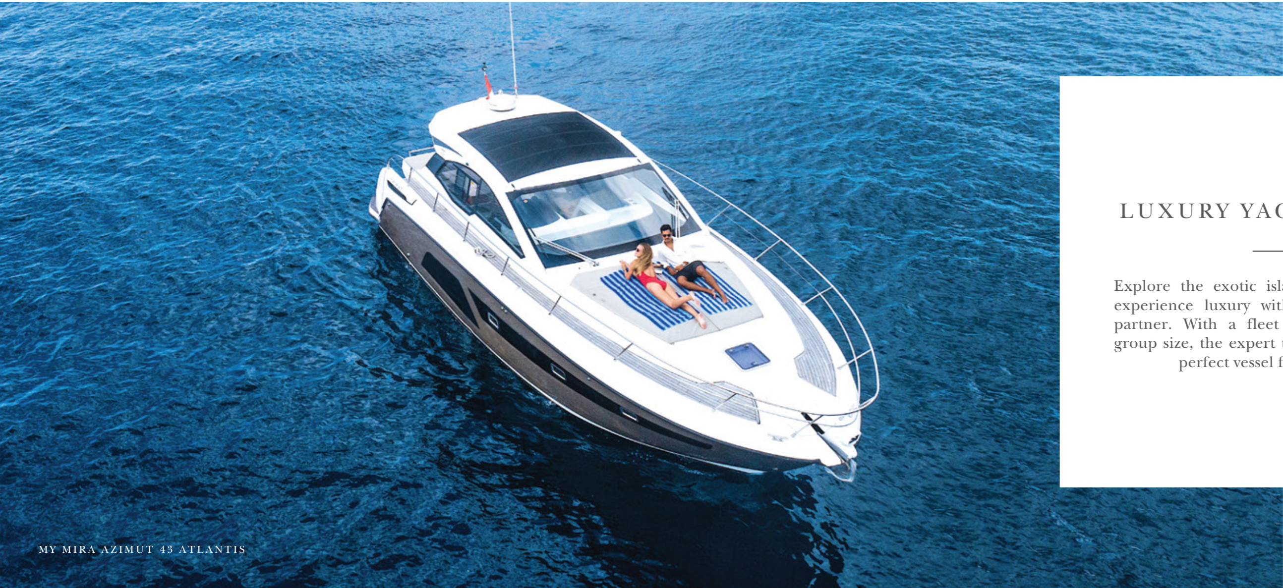
MY MIRA AZIMUT 43 ATLANTIS