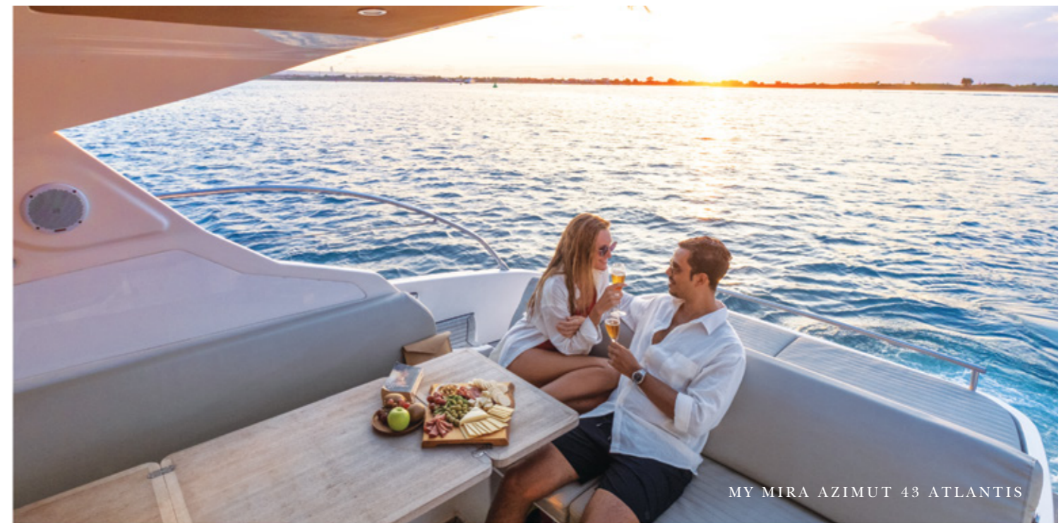
MY MIRA AZIMUT 43 ATLANTIS