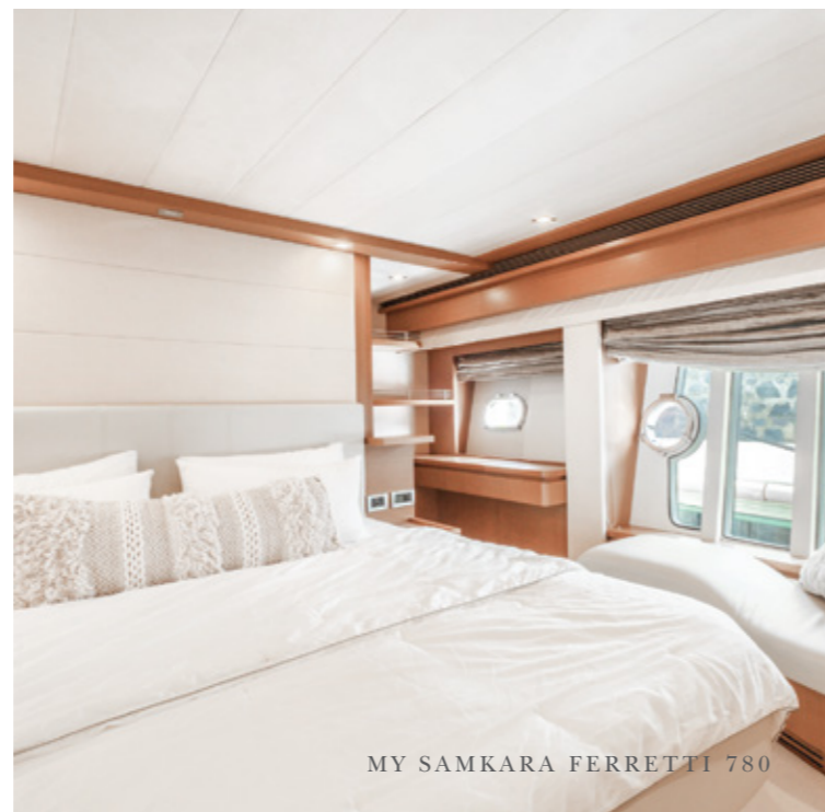
MY SAMKARA FERRETTI 780